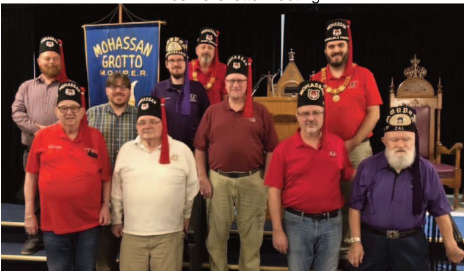
11-08-23 Grotto meeting

Healthy, Wealthy, Wise, and more, Here's to 2024!